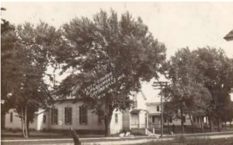
1909 Photo Note Parish Hall in rear & Porch in front